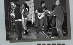
FOSTER Worship Team